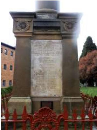
99 th Foot memorial.

We were the first to legalise casinos (1968) while the year previously (1967) we were the first in Australia to abolish 6 o'clock closing. Back in 1895 Tasmania attracted a resident who starved off State bankruptcy. In that year, George Adams arrived after having his lottery enterprises banned on the mainland colonies. Our Premier, Edward Braddon, invited him to set up his business in Tasmania, thus becoming the first State in federated Australia to legalise lotteries. Adams operated his nation-wide business from Hobart and by the 1930s the government's share amounted to almost 50 per cent of its revenue. Sadly, in 1954 without reference to the then Premier Crosgrove, his fellow Labour Victorian colleagues enticed the enterprise to that State. By then, the amiable and kind Adams had long since died.