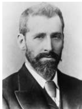
Andrew Inglis Clark.

Andrew Inglis Clark from Hobart has been dubbed "The Father of Federation" and is the instigator of the Hare-Clark system which is peculiar to Tasmania for voting for the Lower House introduced in 1909.