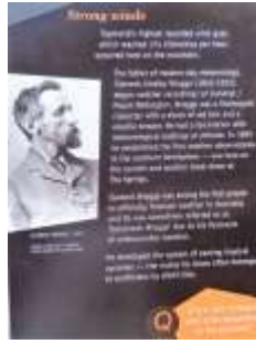
The Wragge story located in the Observatory, Mount Wellington.