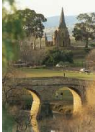
St John Church, Richmond and bridge.