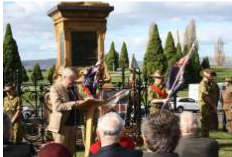
Boer War Day Hobart.

On military matters, we were the first State to organise an annual Boer War Commemorative Day (2002).