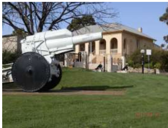
Entrance Anglesea Barracks.

The oldest continuous military establishment is in Hobart, Anglesea Barracks, founded by Governor Lachlan Macquarie, 9 th December 1811.